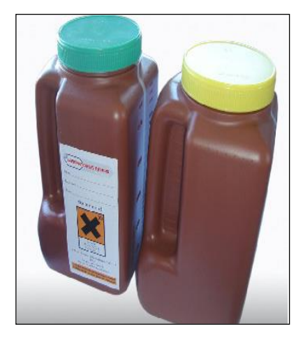
out in to the storage tank.

Empty your bladder in the morning after getting up. This urine is not collected.